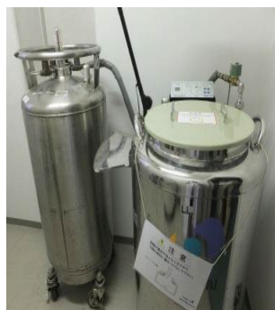
Ultralow temperature tank R-100LM