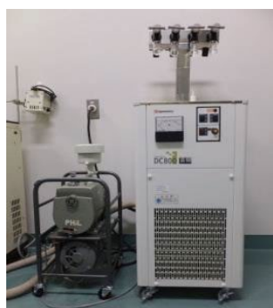
Freeze dryer DC800 (YAMATO)