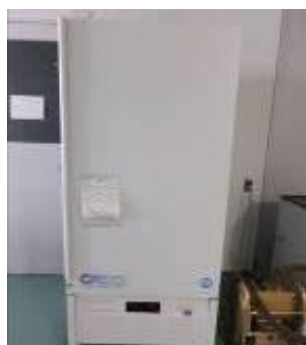
Medical freezer MDF-U442 (SANYO)